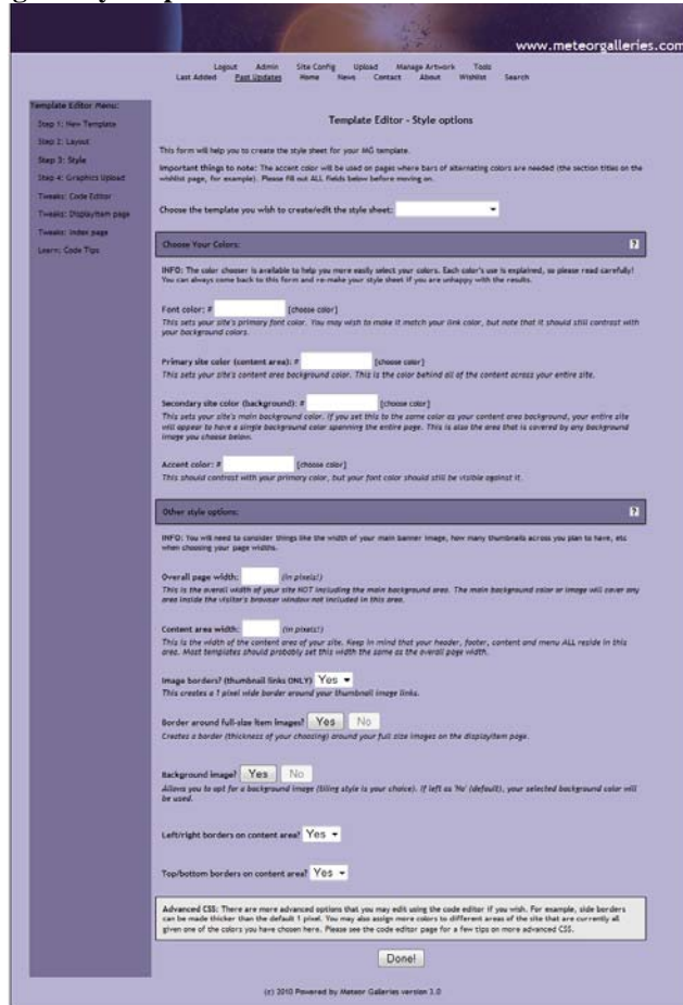
Fig. 3: Style Options

When you are done, the style options page will generate the last important piece of your template—the style sheet.